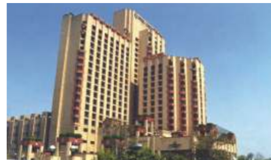
InterContinental The Grand Hotel

Delhi is the capital of India and its third largest city. The city actually consists of two parts. Old Delhi was the capital of Muslim India between the 17 th and 19 th century and has many mosques, monuments and forts. The other Delhi is New Delhi, the imperial city created as the capital of India by the British. In Old Delhi, visit the Raj Ghat, a memorial at the site where Mahatma Gandhi was cremated and drive past the Red Fort, once the most opulent fort and palace of the Moghul empire. In New Delhi, see Humayun's Tomb, an early example of Moghul architecture and the Qutub Minar, the 72.5 metre high victory tower that dates from the onset of Muslim rule in India. Drive along the ceremonial avenue, Rajpath, past the imposing India Gate, Parliament House and the President's Residence.