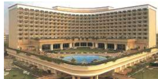
Taj Palace Hotel